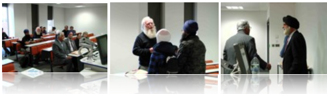
Dr. Indarjit Singh [right] gives a talk on Sikhism Today, organised by Kingston University Chaplaincy, attended by students and members of local religious communities

Sikh Society 2009/2010 saw a great balance of spiritual and practical events, similar to the concept of living a spiritual and temporal life in Sikhi. Sikh Society was able to provide an environment for students as well as learned academics to participate in lectures and events.